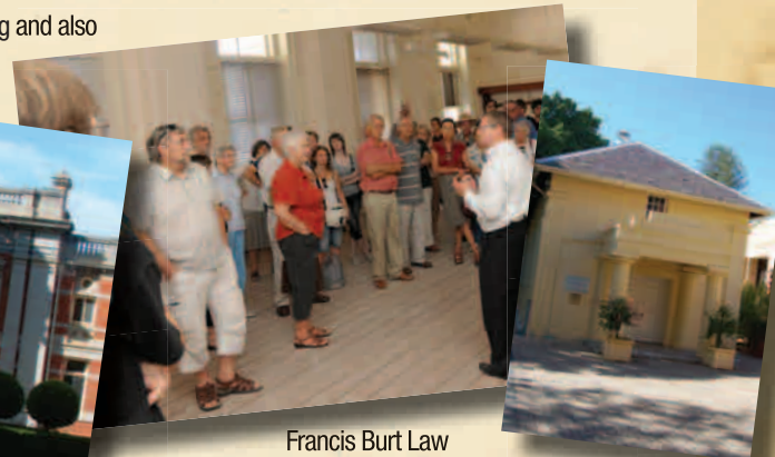
Francis Burt Law

For families, there is even more to do this year than last year. The Old Central Fire Station (opened in 1901), now the FESA Education and Heritage Centre, is hosting a museum open day with rides on vintage fire engines, displays and a spectacular water pumping competition. Just up the road, the RPH Museum will have story-telling and the